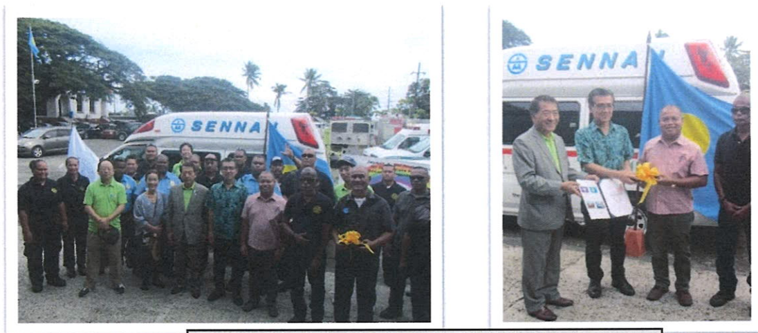
Ambulance Handover Ceremony on September 27, 2019