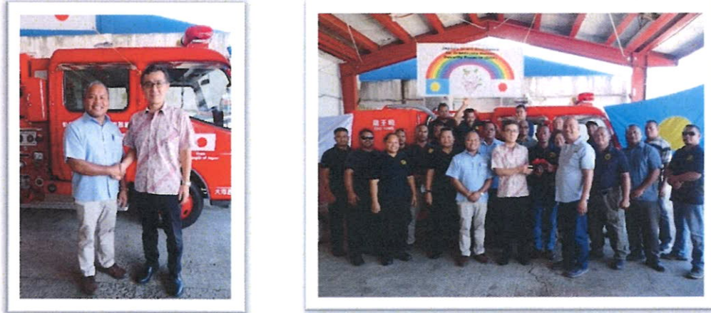
Firetruck Handover Ceremony on February 18, 2020