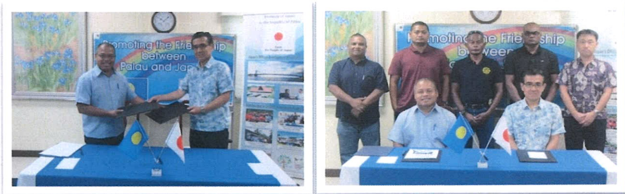
Signing Ceremony at Embassy of Japan-ROP on September 17, 2019

The Embassy of Japan in the Republic of Palau awarded the sum of $90,800 to the Bureau of Public Safety's Division of Fire and Rescue, Ministry of Justice, for the project for the Procurement of Firetruck and Ambulance for the Republic of Palau. The grant was to be used to cover the costs of recondition/remodeling two used vehicles, an ambulance and a firetruck, the transportation/shipping expenses from Japan to Palau, and the cost of operational & mechanical training of the vehicles in Palau pursuant to the Grant Contract executed between the Embassy of Japan and Bureau of Public Safety, Ministry of Justice on September 17, 2019, as shown below: